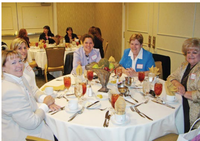
Family Violence Directors Roundtable

The Office on Women's Policy (OWP) will continue to be the guiding agency to make certain that family violence shelters are available, accessible and responsive to all citizens. With its department and agency partners, community advocates, and governmental leadership, OWP is working toward the goal to end family violence and ensure survivors and their loved ones lead safe, independent, and quality lives.